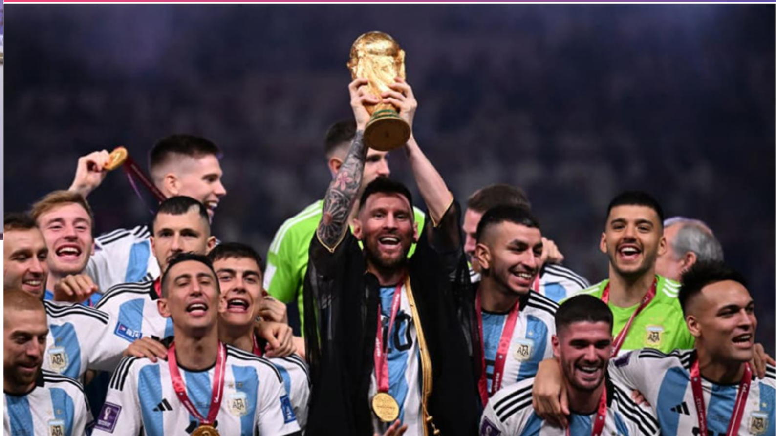
Return of the Mark: Argentina's World Cup victors

In the championship game at the Lusail Stadium, Messi scored twice, but France fought twice, once from a two-goal down, to force penalties.